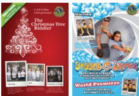
Previous Cannes program movie poster examples

Cannes program films are Professionally Edited with Sound Design